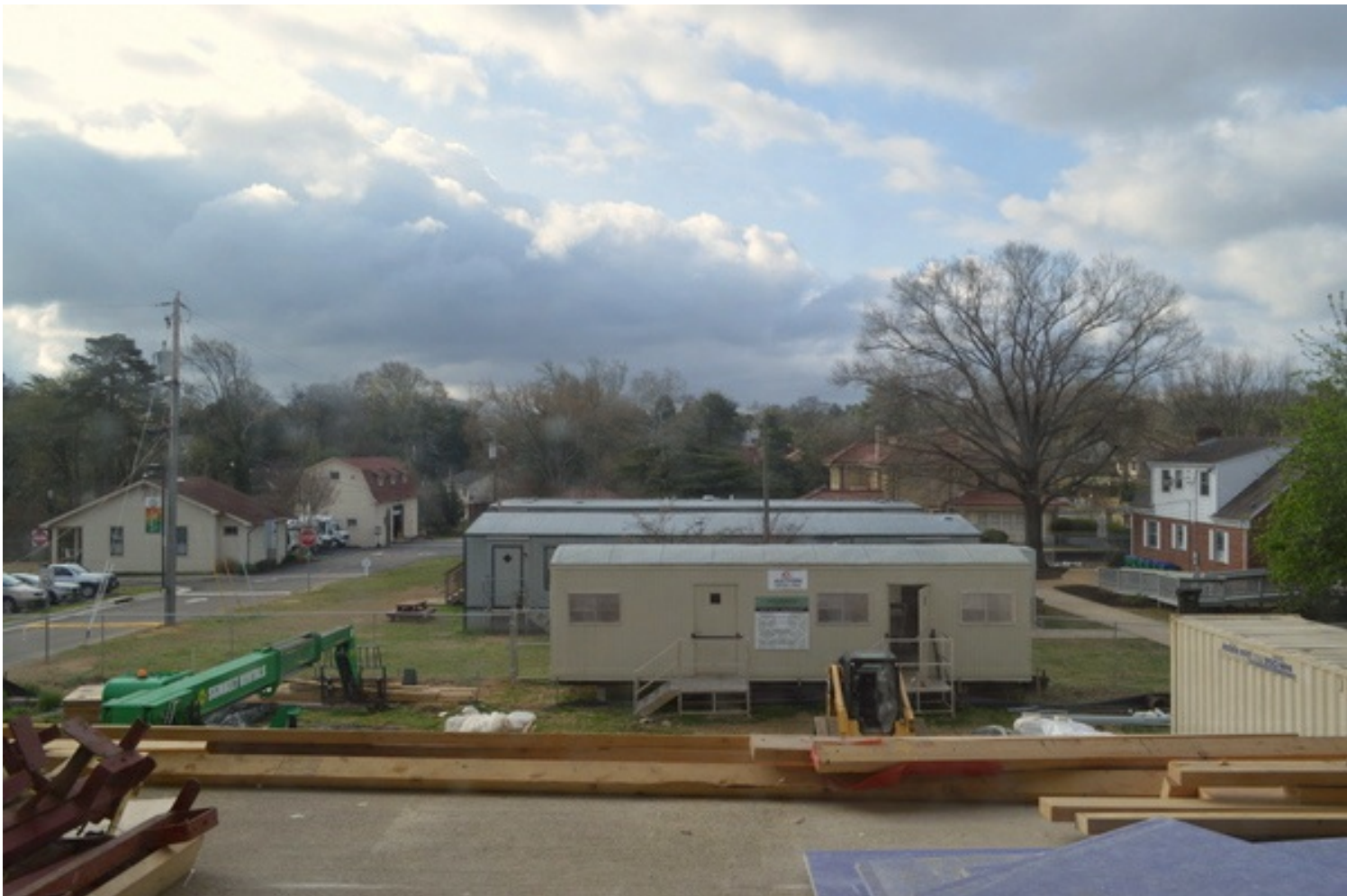
The view from the second floor balcony. Soon we will have our green back!